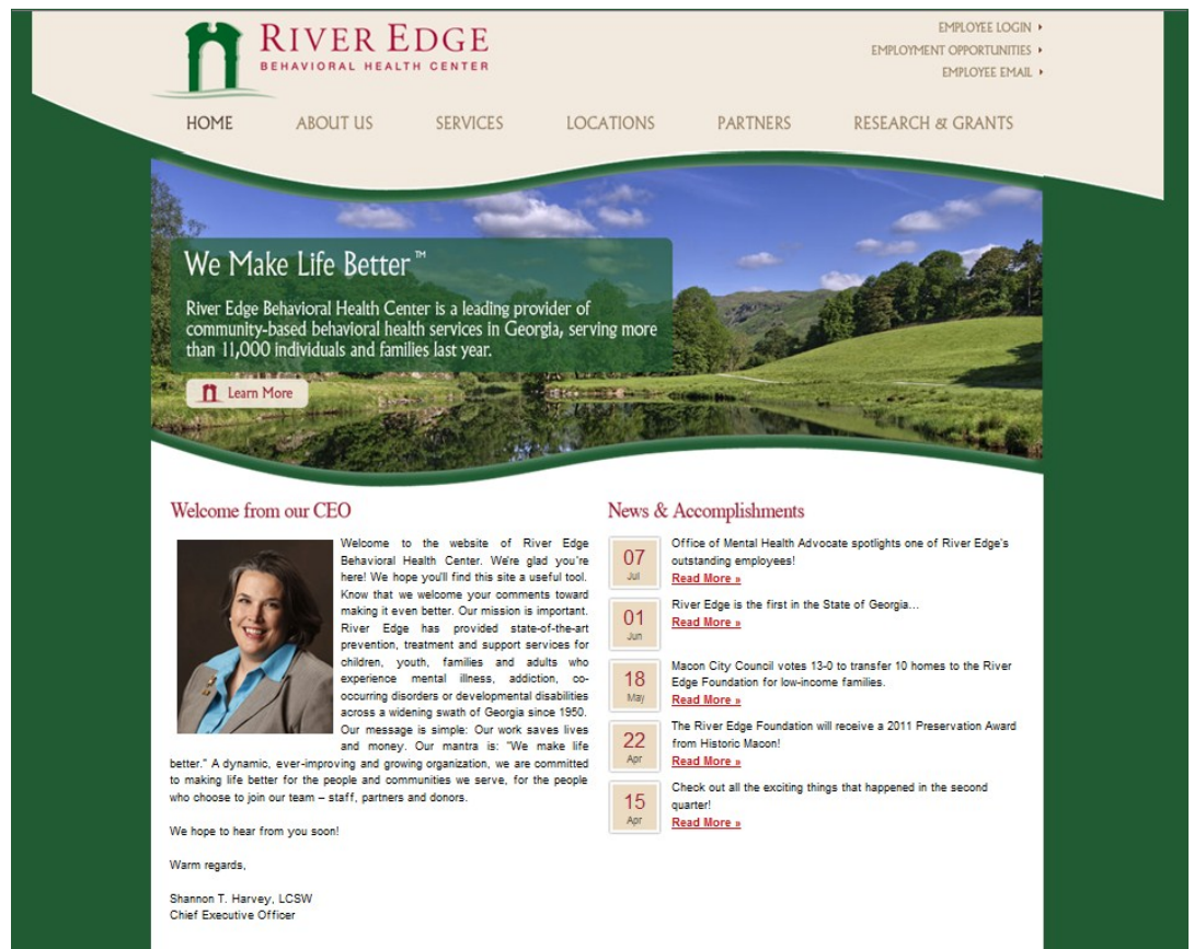
River Edge Website –Now! 2011

In January 2011, Rive Edge Behavioral Health Center launched its new and greatly improved website. Visit it soon to stay current with all of our expansions and improvements in behavioral health, developmental disability, and supportive services that we offer to Central Georgia.